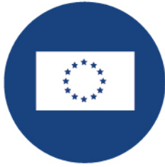
Multinational Corporations (MNCs)

We have a large pool of IT staffing resources, experienced in several industries: