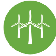
ENERGY & UTILITIES